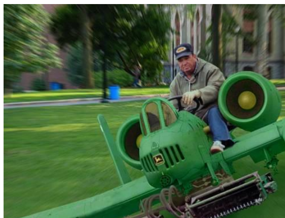
John Deere A-10 Riding Mower